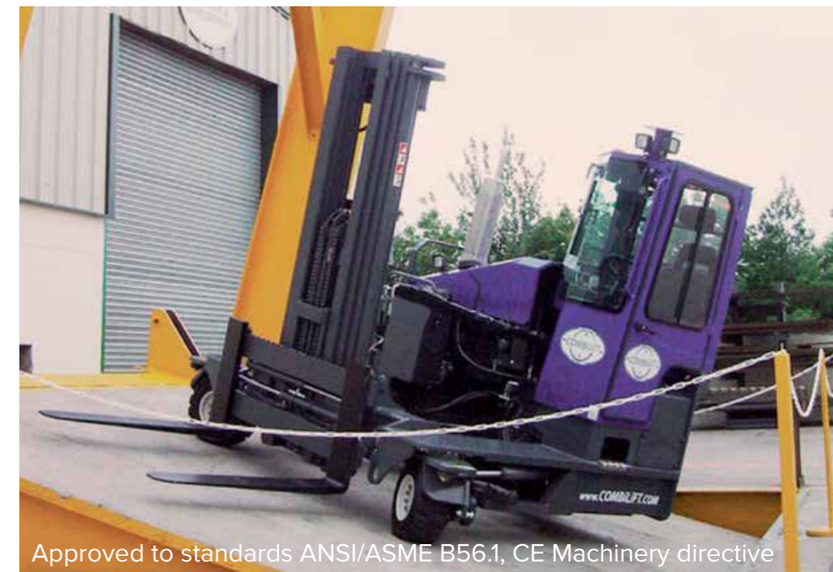
Approved to standards ANSI/ASME B56.1, CE Machinery directive